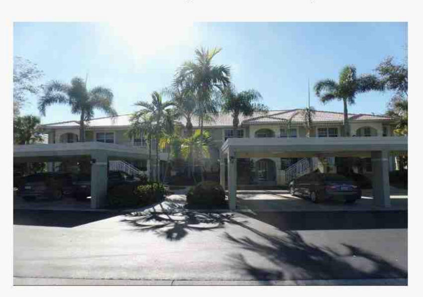
2340 Carrington Ct Naples