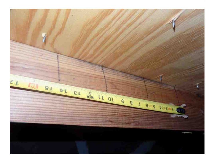
Vrap 8D Nails Every 6 Inches