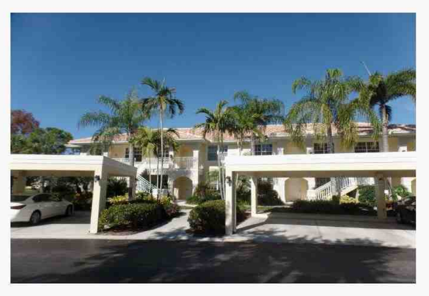
2325 Carrington Ct